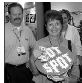
2004 Hot Spot Winner

Don't miss your opportunity to win $500 in the Exhibit Hall Scavenger Hunt. Simply collect stickers from exhibitors in each color-coded section of the Exhibit Hall and place them on the Scavenger Hunt card included in your registration bag (a map can be found on the back of the card). Drop off your completed card in the box located in the Exhibit Hall. The drawing will be held on Wednesday, August 10, at 1:30 PM, and the winner will be announced inside the Exhibit Hall. ☐