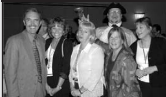
2004 President's Reception, Boston, MA

Greet your AHRA friends and meet new ones at the annual event. Dress is business attire.