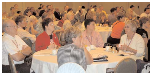
First Time Attendee / New Member Breakfast

According to Fodor's travel guide, "In general, the most visited city in Texas draws 3 types of tourists: Texans who come to shop and sightsee; conventioners; and visitors from northern Mexico, especially during Christmas and Holy Week." (source: http://www.fodors.com/miniguides ). This week, more than 1,000 conventioners have preregistered for AHRA's 33rd Annual Meeting & Exposition.